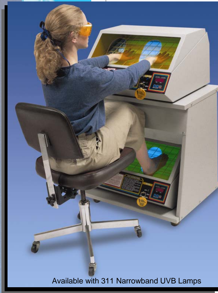
Available with 311 Narrowband UVB Lamps