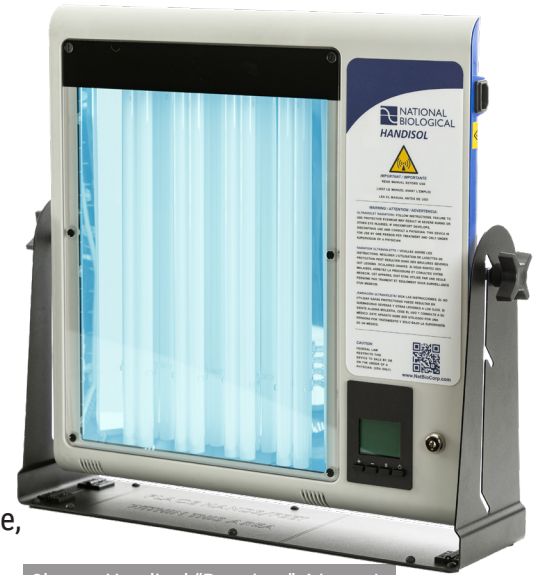
Shown: Handisol "Premium" 4 Lamp*

The redesigned Handisol ® is an affordable, mid-size, home phototherapy system that offers efficiency, effectiveness, and affordability. The Handisol ® is designed to provide effective localized treatments for psoriasis, vitiligo, and other photoresponsive skin conditions - all from the comfort, convenience, and privacy of your own home.